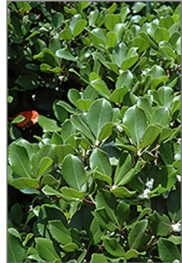
Eleanor Taber Indian Hawthorn foliage

This shrub does best in full sun to partial shade. It prefers to grow in average to moist conditions, and shouldn't be allowed to dry out. It may require supplemental watering during periods of drought or extended heat. It is not particular as to soil type or pH. It is somewhat tolerant of urban pollution. This is a selected variety of a species not originally from North America.