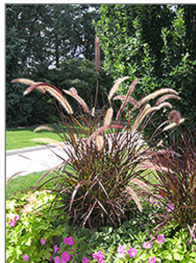
Purple Fountain Grass flowers

Purple Fountain Grass is recommended for the following landscape applications;