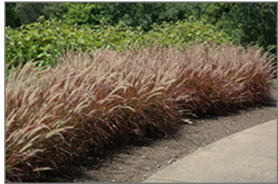
Purple Fountain Grass in bloom

Purple Fountain Grass will grow to be about 4 feet tall at maturity, with a spread of 3 feet. It grows at a medium rate, and under ideal conditions can be expected to live for approximately 10 years. As an herbaceous perennial, this plant will usually die back to the crown each winter, and will regrow from the base each spring. Be careful not to disturb the crown in late winter when it may not be readily seen!