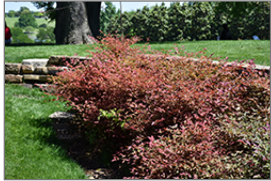
Flirt Nandina

Flirt Nandina is recommended for the following landscape applications;