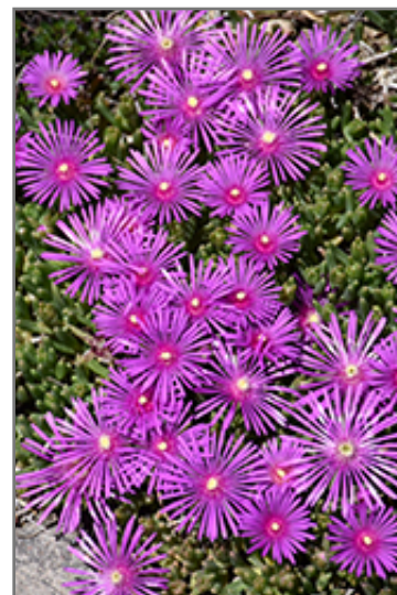
Purple Ice Plant flowers

Purple Ice Plant is recommended for the following landscape applications;