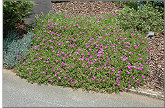
Purple Ice Plant in bloom

Purple Ice Plant will grow to be only 2 inches tall at maturity extending to 3 inches tall with the flowers, with a spread of 24 inches. Its foliage tends to remain low and dense right to the ground. It grows at a fast rate, and under ideal conditions can be expected to live for approximately 5 years. As an evergreen perennial, this plant will typically keep its form and foliage year-round.