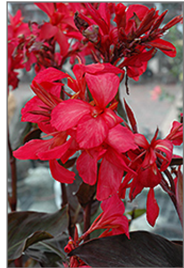
Bronze Water Canna flowers