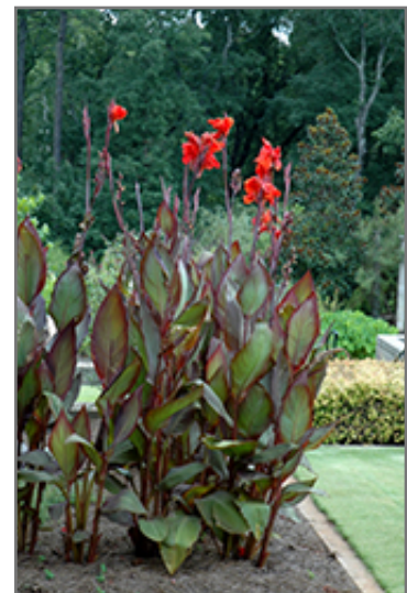
Bronze Water Canna in bloom