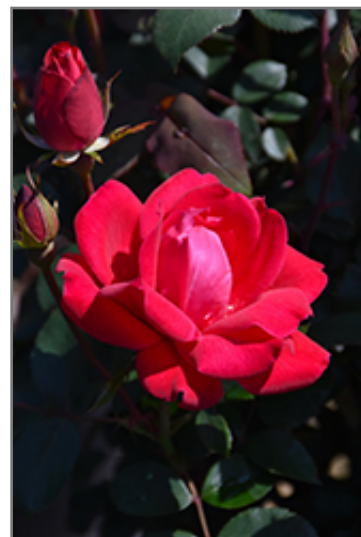
Double Knock Out Rose flowers

Double Knock Out Rose is recommended for the following landscape applications;