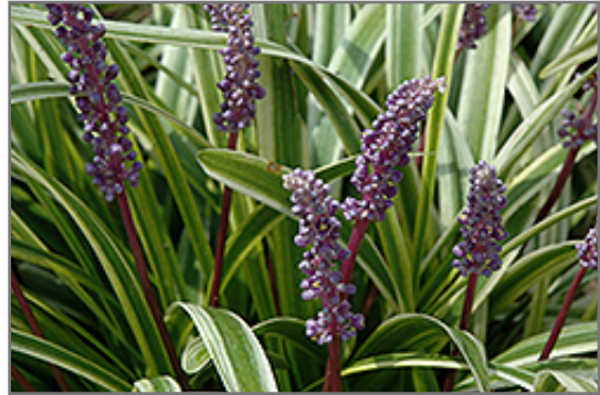
Variegata Lily Turf flowers

Variegata Lily Turf is recommended for the following landscape applications;