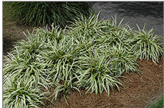
Variegata Lily Turf in bloom