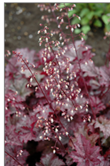
Amethyst Mist Coral Bells flowers