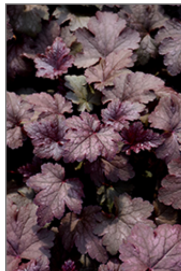
Amethyst Mist Coral Bells foliage

Amethyst Mist Coral Bells is recommended for the following landscape applications;