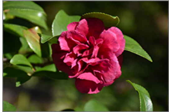
Bonanza Camellia flowers