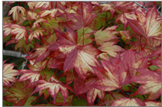
Tsuma Gaki Japanese Maple foliage

Tsuma Gaki Japanese Maple will grow to be about 10 feet tall at maturity, with a spread of 10 feet. It tends to be a little leggy, with a typical clearance of 2 feet from the ground, and is suitable for planting under power lines. It grows at a slow rate, and under ideal conditions can be expected to live for 60 years or more.