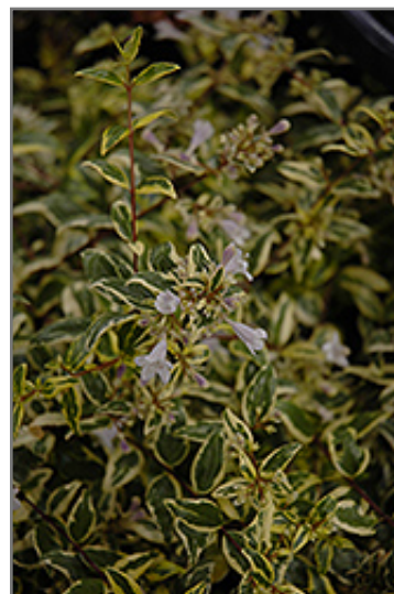
Twist of Lime Glossy Abelia flowers

Twist of Lime Glossy Abelia makes a fine choice for the outdoor landscape, but it is also well-suited for use in outdoor pots and containers. It can be used either as 'filler' or as a 'thriller' in the 'spiller-thriller-filler' container combination, depending on the height and form of the other plants used in the container planting. It is even sizeable enough that it can be grown alone in a suitable container. Note that when grown in a container, it may not perform exactly as indicated on the tag - this is to be expected. Also note that when growing plants in outdoor containers and baskets, they may require more frequent waterings than they would in the yard or garden.