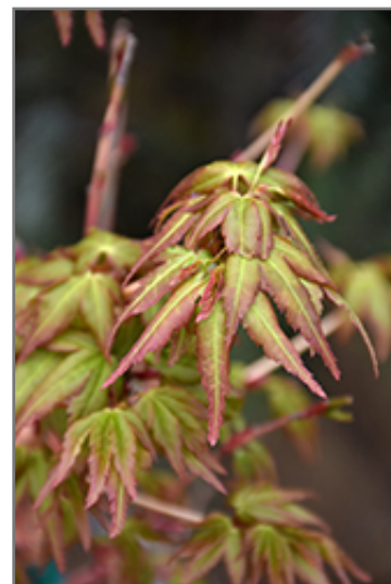
Golden Bark Japanese Maple foliage