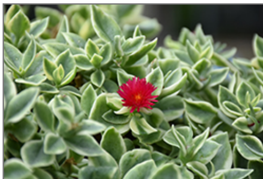
Variegated Baby Sun Rose flowers

Variegated Baby Sun Rose is recommended for the following landscape applications;