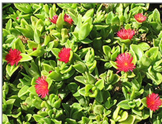
Red Apple Baby Sun Rose in bloom