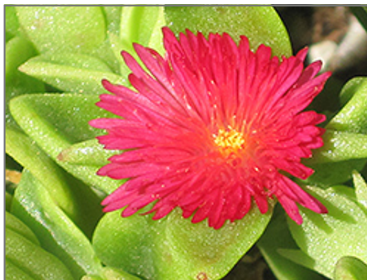
Red Apple Baby Sun Rose flowers

Red Apple Baby Sun Rose is recommended for the following landscape applications;