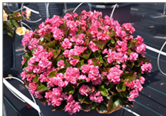
Double Up Pink Begonia in bloom