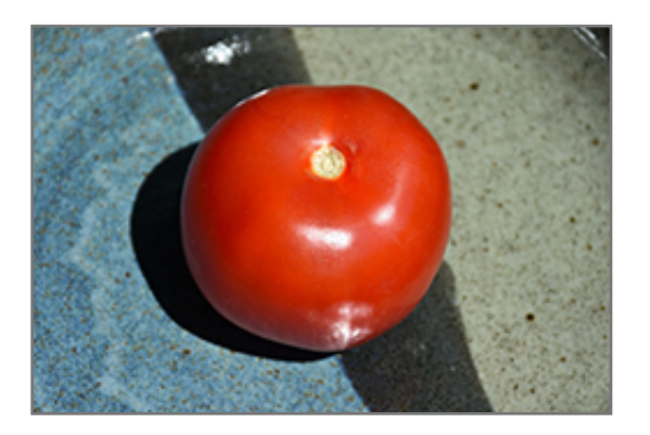
Amelia Tomato fruit