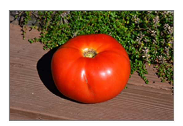
Park's Whopper Tomato fruit