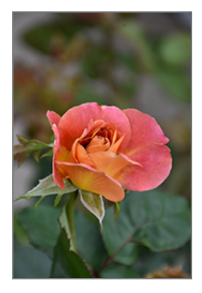
Rosie The Riveter Rose flower buds