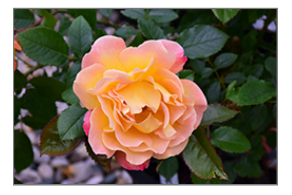
Rosie The Riveter Rose flowers

This shrub will require occasional maintenance and upkeep, and is best pruned in late winter once the threat of extreme cold has passed. It is a good choice for attracting bees to your yard. Gardeners should be aware of the following characteristic(s) that may warrant special consideration;