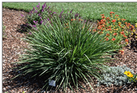
Coolvista Dianella

Coolvista Dianella will grow to be about 24 inches tall at maturity, with a spread of 24 inches. Its foliage tends to remain dense right to the ground, not requiring facer plants in front. It grows at a medium rate, and under ideal conditions can be expected to live for approximately 10 years. As an evergreen perennial, this plant will typically keep its form and foliage year-round.