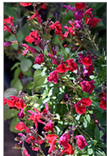
Mirage Cherry Red Autumn Sage flowers