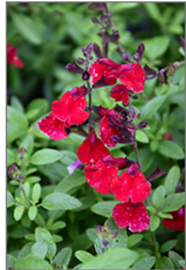
Mirage Cherry Red Autumn Sage flowers

This is a relatively low maintenance plant, and should only be pruned after flowering to avoid removing any of the current season's flowers. It is a good choice for attracting bees, butterflies and hummingbirds to your yard, but is not particularly attractive to deer who tend to leave it alone in favor of tastier treats. It has no significant negative characteristics.