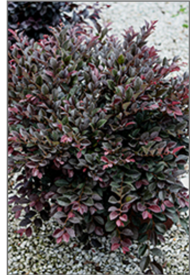
Red Diamond Fringeflower