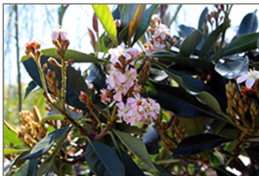
Coppertone Loquat flowers