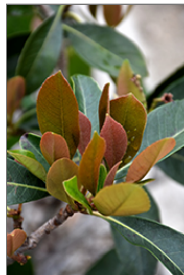
Coppertone Loquat foliage

This is a multi-stemmed evergreen tree with an upright spreading habit of growth. Its average texture blends into the landscape, but can be balanced by one or two finer or coarser trees or shrubs for an effective composition. This plant will require occasional maintenance and upkeep, and should only be pruned after flowering to avoid removing any of the current season's flowers. It is a good choice for attracting birds and bees to your yard. It has no significant negative characteristics.