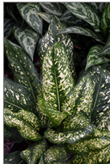
Lumina Chinese Evergreen foliage