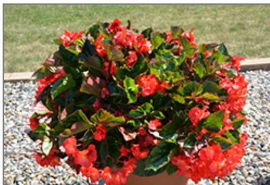
Megawatt Red Green Leaf Begonia in bloom

Megawatt Red Green Leaf Begonia is a fine choice for the garden, but it is also a good selection for planting in outdoor containers and hanging baskets. With its upright habit of growth, it is best suited for use as a 'thriller' in the 'spiller-thriller-filler' container combination; plant it near the center of the pot, surrounded by smaller plants and those that spill over the edges. It is even sizeable enough that it can be grown alone in a suitable container. Note that when growing plants in outdoor containers and baskets, they may require more frequent waterings than they would in the yard or garden.