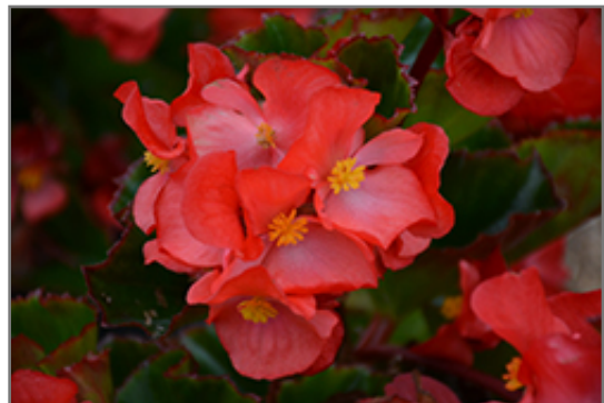
Megawatt Red Green Leaf Begonia flowers