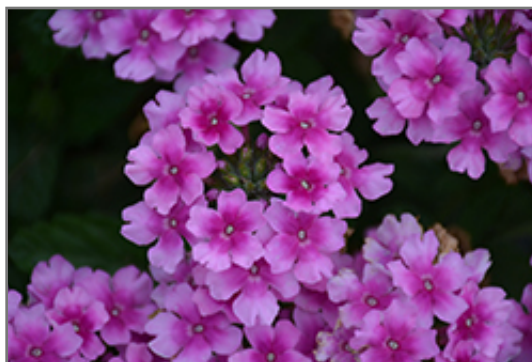
EnduraScape Pink Bicolor Verbena flowers

This plant will require occasional maintenance and upkeep. Trim off the flower heads after they fade and die to encourage more blooms late into the season. Deer don't particularly care for this plant and will usually leave it alone in favor of tastier treats. It has no significant negative characteristics.