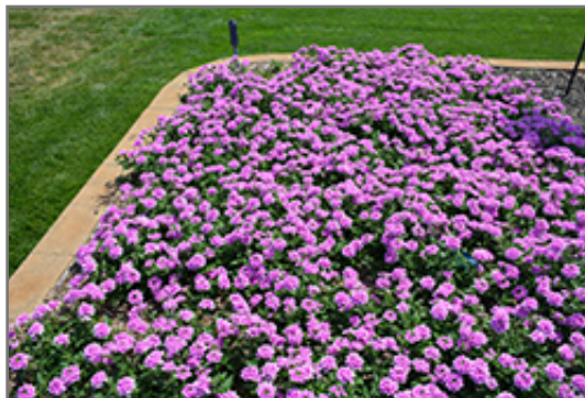
EnduraScape Pink Bicolor Verbena in bloom

EnduraScape Pink Bicolor Verbena will grow to be about 12 inches tall at maturity, with a spread of 24 inches. When grown in masses or used as a bedding plant, individual plants should be spaced approximately 18 inches apart. Its foliage tends to remain dense right to the ground, not requiring facer plants in front. It grows at a fast rate, and under ideal conditions can be expected to live for approximately 3 years. As an herbaceous perennial, this plant will usually die back to the crown each winter, and will regrow from the base each spring. Be careful not to disturb the crown in late winter when it may not be readily seen!