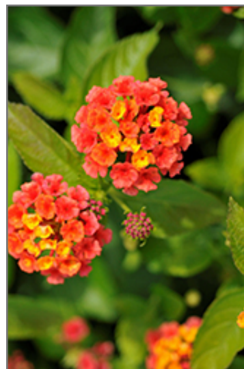
Landscape Bandana Red Lantana flowers

Landscape Bandana Red Lantana is recommended for the following landscape applications;