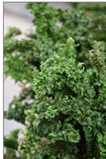
Emina Curly Boston Fern foliage