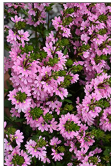
Whirlwind Pink Fan Flower flowers

Whirlwind Pink Fan Flower is recommended for the following landscape applications;