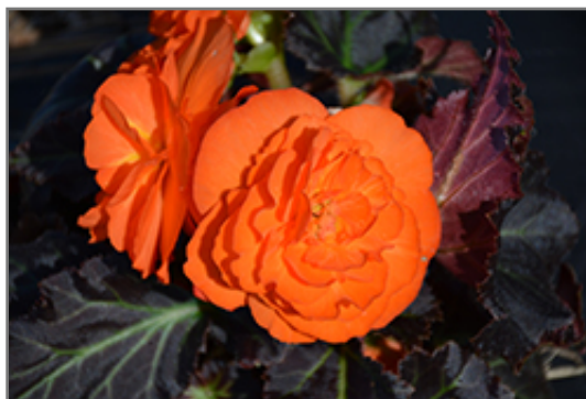
Nonstop Mocca Bright Orange Begonia flowers

Nonstop Mocca Bright Orange Begonia is recommended for the following landscape applications;