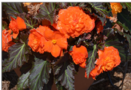
Nonstop Mocca Bright Orange Begonia flowers