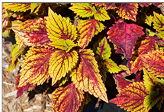
Color Clouds Hottie Coleus foliage

Color Clouds Hottie Coleus is recommended for the following landscape applications;