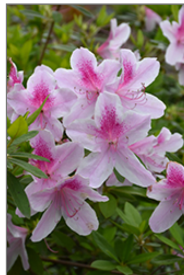
George Lindley Taber Azalea flowers