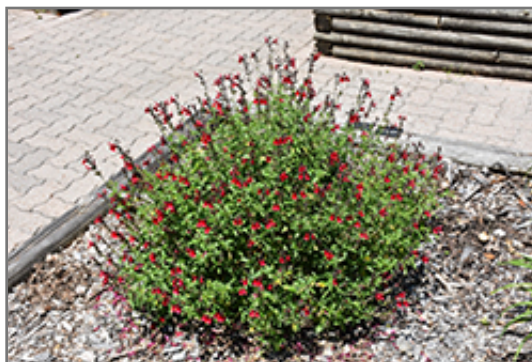
Radio Red Autumn Sage in bloom