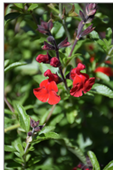
Radio Red Autumn Sage flowers