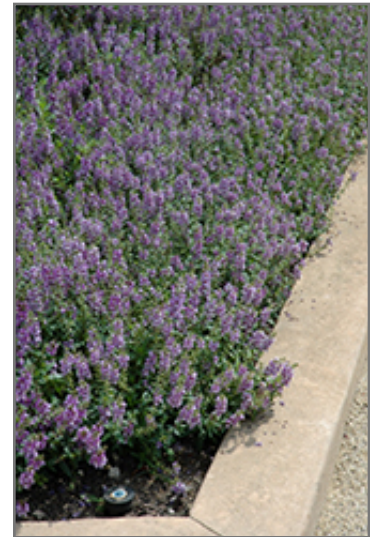
Serenita Sky Blue Angelonia in bloom

Serenita Sky Blue Angelonia is a fine choice for the garden, but it is also a good selection for planting in outdoor containers and hanging baskets. It is often used as a 'filler' in the 'spiller-thriller-filler' container combination, providing a mass of flowers against which the larger thriller plants stand out. Note that when growing plants in outdoor containers and baskets, they may require more frequent waterings than they would in the yard or garden.