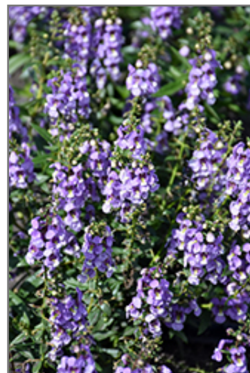
Serenita Sky Blue Angelonia flowers

Serenita Sky Blue Angelonia is an herbaceous evergreen perennial with an upright spreading habit of growth. Its relatively fine texture sets it apart from other garden plants with less refined foliage.