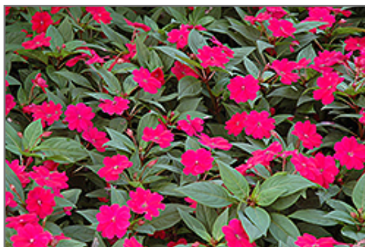
Bounce Cherry Impatiens in bloom