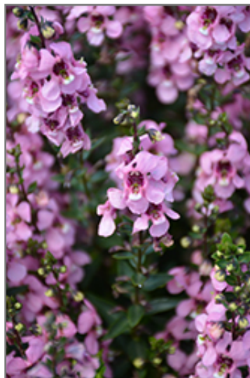
Serenita Pink Angelonia flowers