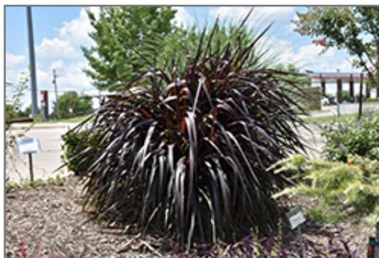
Princess Caroline Fountain Grass

Princess Caroline Fountain Grass is recommended for the following landscape applications;