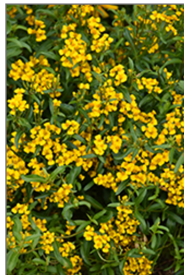
Mexican Mint Marigold flowers

Mexican Mint Marigold features showy yellow daisy flowers with gold eyes at the ends of the stems from late summer to early fall. Its attractive fragrant narrow compound leaves remain green in color throughout the season.