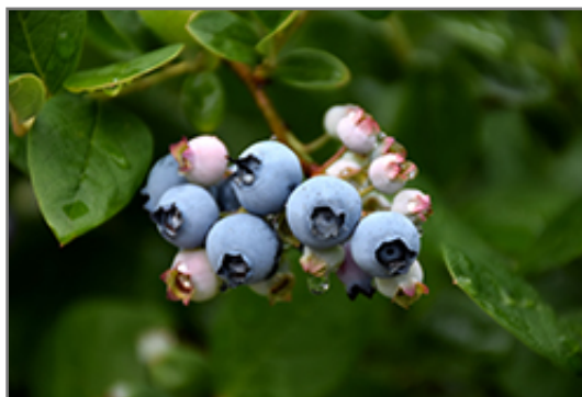
Elliott Blueberry fruit

Elliott Blueberry features dainty clusters of white bell-shaped flowers with shell pink overtones hanging below the branches in mid spring. It has green deciduous foliage. The glossy oval leaves turn yellow in fall. It features an abundance of magnificent blue berries from late summer to early fall. The smooth brick red bark adds an interesting dimension to the landscape.