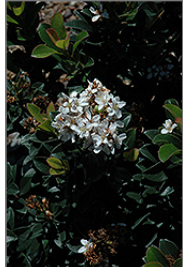
Snow White Indian Hawthorn flowers