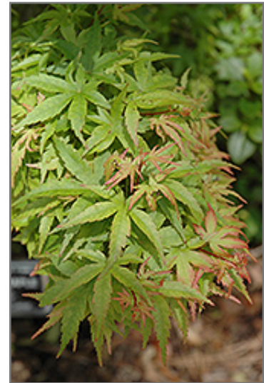
Sharp's Pygmy Japanese Maple foliage