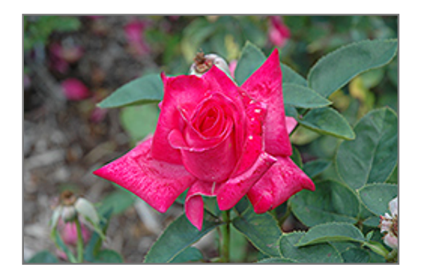
Elizabeth Taylor Rose flowers

2974 Johnston St., Lafayette, LA 70503 (337) 264-1418 buyallseasons.com