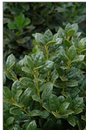
Dwarf Burford Chinese Holly foliage

Dwarf Burford Chinese Holly is recommended for the following landscape applications;