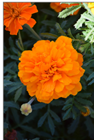
Safari Tangerine Marigold flowers