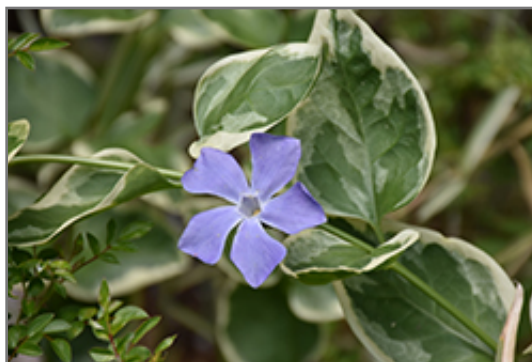
Variegated Periwinkle flowers