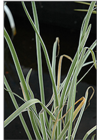
Variegated Society Garlic foliage

This plant is quite ornamental as well as edible, and is as much at home in a landscape or flower garden as it is in a designated herb garden. It does best in full sun to partial shade. It prefers to grow in moist to wet soil, and will even tolerate some standing water. It may require supplemental watering during periods of drought or extended heat. It is not particular as to soil type or pH. It is somewhat tolerant of urban pollution. This is a selected variety of a species not originally from North America. It can be propagated by division; however, as a cultivated variety, be aware that it may be subject to certain restrictions or prohibitions on propagation.