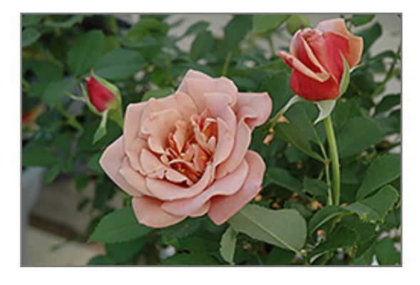
Koko Loko Rose flowers