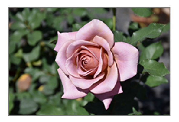
Koko Loko Rose flowers

2974 Johnston St., Lafayette, LA 70503 (337) 264-1418 buyallseasons.com