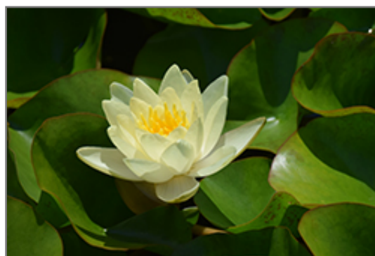
Marliacea Chromatella Hardy Water Lily flowers