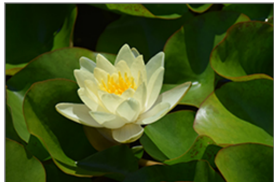
Marliacea Chromatella Hardy Water Lily flowers