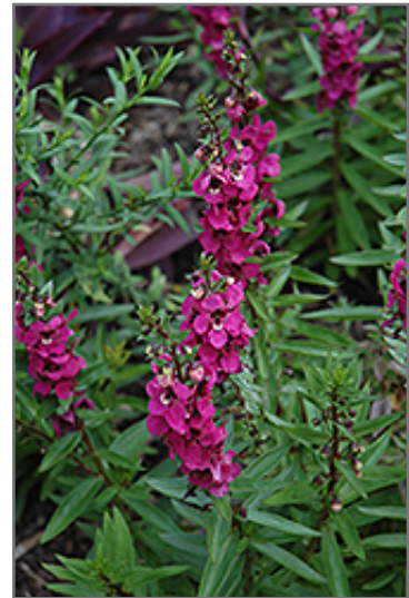
Serenita Raspberry Angelonia flowers

Serenita Raspberry Angelonia is recommended for the following landscape applications;