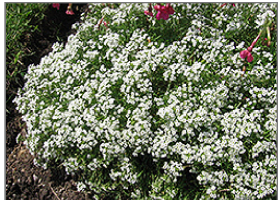
Wonderland White Alyssum in bloom