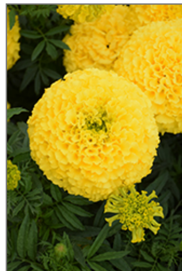
Marvel Yellow Marigold flowers

Marvel Yellow Marigold is recommended for the following landscape applications;